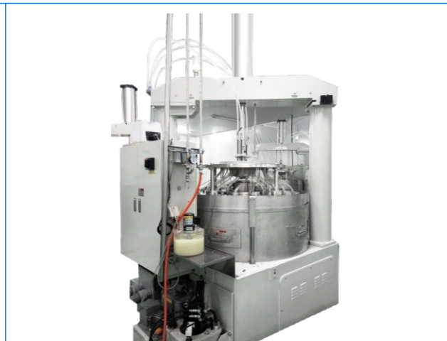
天通控股股份有限公司 / TDG Holding Co., Ltd.