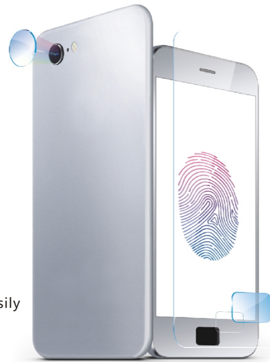
蓝宝石手机面板 Sapphire Phone Cover