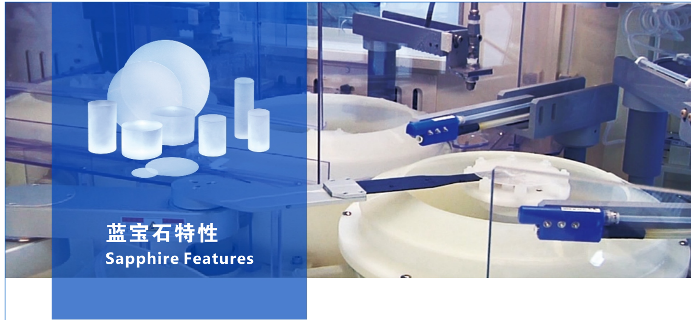
蓝宝石特性 Sapphire Features